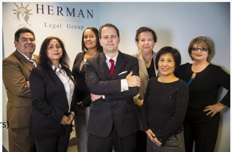
Herman Legal Group Immigration Law