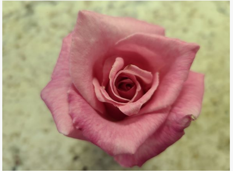
The rose "Eiffel Tower" from the garden of Robert Ardini

This press release can be viewed online at: https://www.einpresswire.com/article/603847692