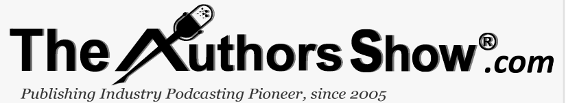
The Authors Show Logo