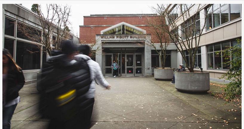
Seattle University's Albers School of Business and Economics launched their MBA in Sport and Entertainment Management in March 2021

This press release can be viewed online at: https://www.einpresswire.com/article/603923277