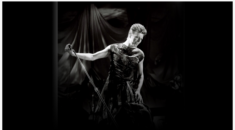
David Bowie - London 2 - 1996

This press release can be viewed online at: https://www.einpresswire.com/article/604018024