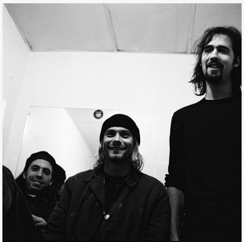
Nirvana - Bristol - 1991