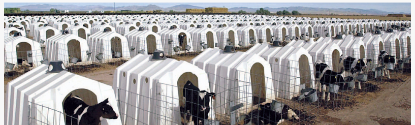
Veal calves on a factory farm