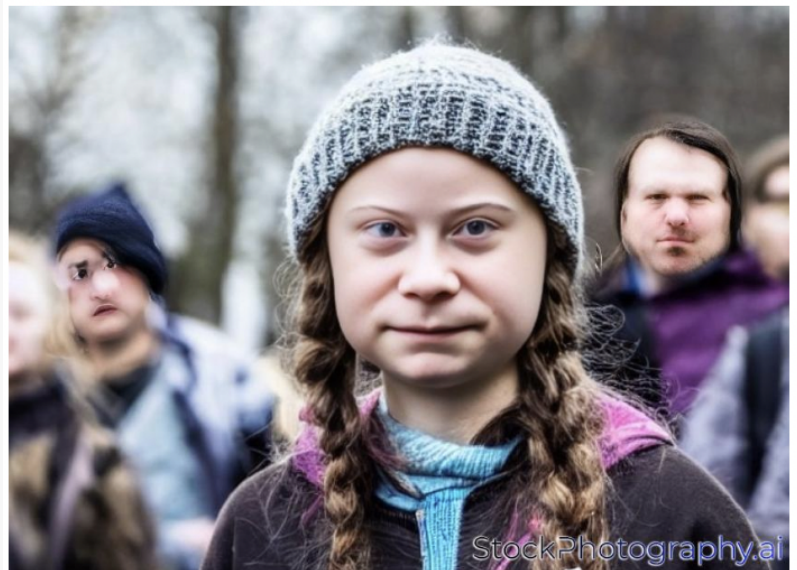
STOCKHOLM, SWEDEN - FEBRUARY 08, 2019: Greta Thunberg climate activist. School strike on Fridays.

AI generated watercolor painting of Elephants and children.