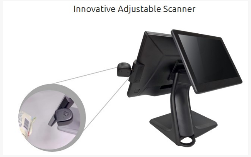
Ares550 POS system Equipped with the Latest Adjustable Scanner

Ares550 POS System with Innovative Mechanical Design of Easy Access