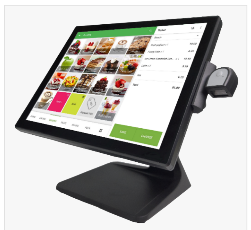
Ares550 POS System with Intel Elkhart Lake CPU

Easy Access M.2 SSD M-Key PCI-e Gen 3 x 4 NVME