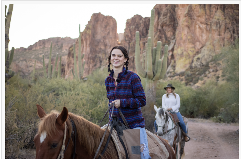
Adventure Explorer- Wildjoy at Saguaro Lake Stables

seamless on the passport. Guests can also download the accompanying Adventure Explorer Guide that features a detailed listing of Arizona birds, wildlife, flora, outfitter listings, and helpful tips on how to prepare for your visit to the Sonoran Desert.