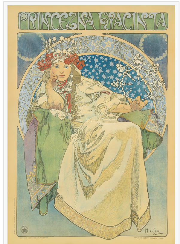
Alphonse Mucha, Princezna Hyacinta, 1911. ($78,000)

Overall, works by Art Nouveau masters were highly sought after. Adolfo Hohenstein 's dramatic 1899 Tosca was secured for a winning bid of $40,800 (est. $15,000-$20,000). Privat Livemont's iconic 1896 Absinthe Robette performed consistently well, topping out at $21,600. From Théophile-Alexandre Steinlen, a Russian text variant of his infamous 1896 Chat Noir was claimed for $19,200. Joseph Maria Olbrich's 1901 Darmstadt sold for $16,800; Ludwig Hohlwein's 1913 Kaffee Hag went for $19,200; H. Gray's 1899 Cycles Sirius surpassed its estimate of $4,000-$5,000