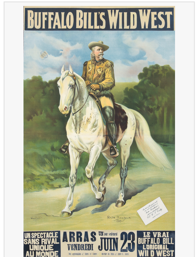
Rosa Bonheur, Buffalo Bill / The Last of the Great Scouts. 1905. ($20,400)