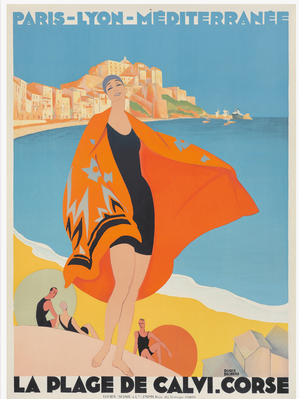
Roger Broders, La Plage de Calvi. Corse. 1928. ($15,600)