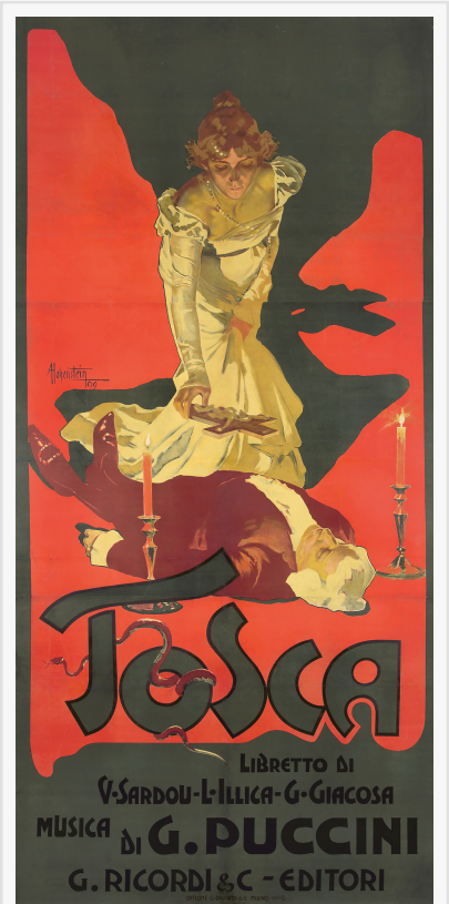
Adolfo Hohenstein, Tosca. 1899. ($40,800)

This press release can be viewed online at: https://www.einpresswire.com/article/604214207