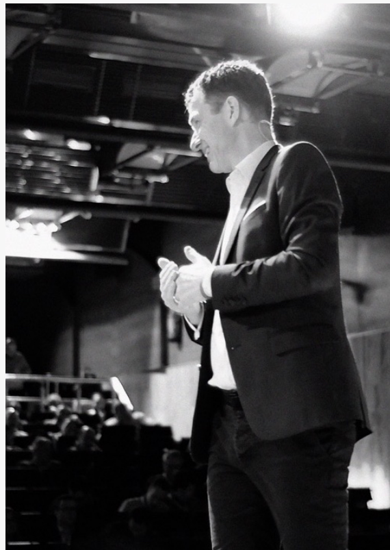
Coaching For Performance