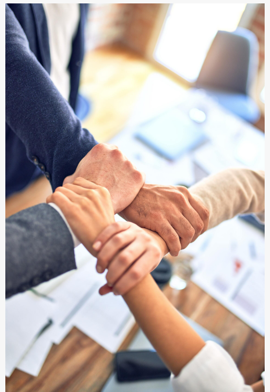
High Performance Executive Coaching