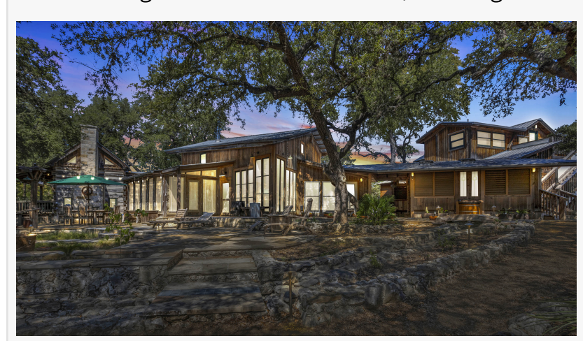
1145 Cypress Cove Road in Spring Branch, Texas