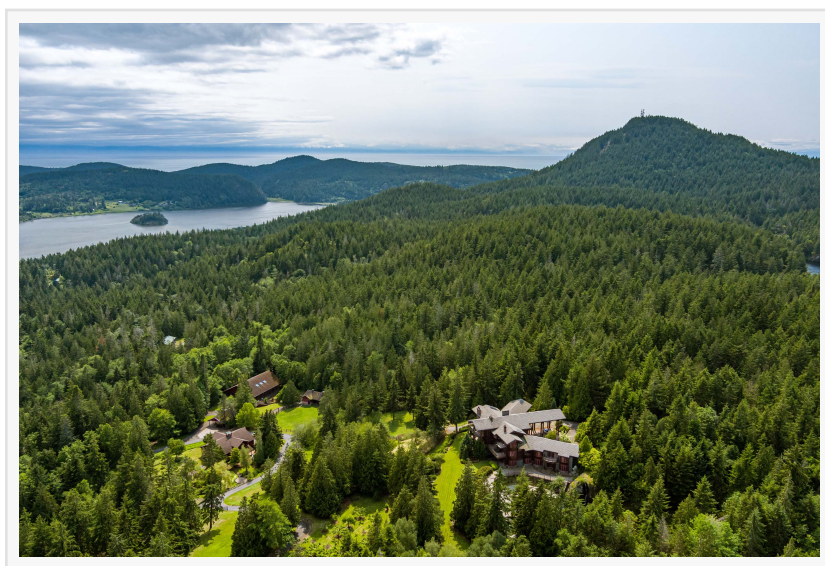
Scimitar Ridge Ranch north of Seattle, Washington

Cedar heart log beams, original London cobblestones and a forested mountain top location conjure skilodge vibes amidst the coastal beauty of the Pacific Northwest. Once owned by the heiress of the Ralston-Purina fortune, Scimitar Ridge Ranch has a rustic elegance that fits its country getaway location. This estate offers many possibilities, from a multigenerational retreat, event venue, or a stunning spot to escape the hustle and work-from-home surrounded by