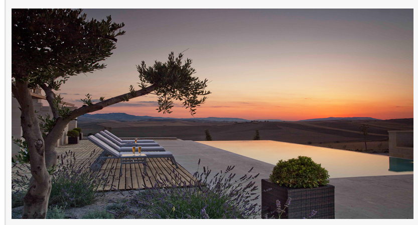
Masseria Mimosa in Matera, Italy

the ocean and forests. Designed with entertaining in mind, Scimitar Ridge Ranch offers a bevy of settings to delight friends and family. The indoor grotto pool is surrounded by Montana Rhyolite stone walls, Idaho siltstone floors, two waterfalls, and sunlight filtering through the wall of French doors. Adjacent to a 2,900-acre forest preserve, the private estate will be undisturbed and surrounded by an old-growth forest. Equestrian facilities round out the incredible amenities