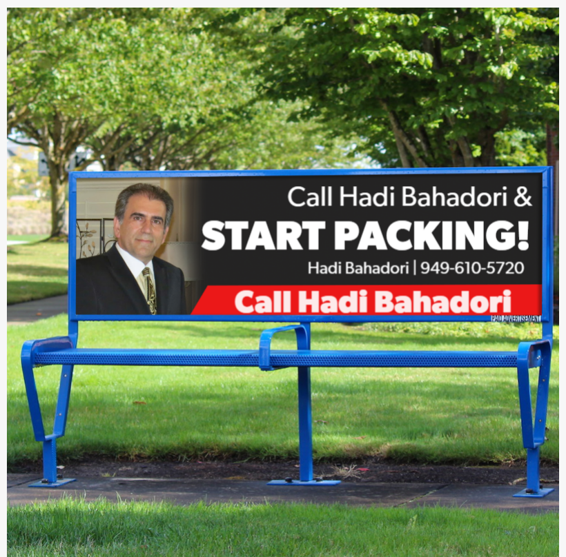
Discount realtors In Los Angeles County.

Home Smart Evergreen is probably one of the best real estate companies that offer a 1 percent commission realtor in Los Angeles County . Their listing fee is very low and people selling their homes want to know that if there are any additional fees. Their state of art marketing has helped many homeowners to sell their homes for top dollars and in the shortest amount of time. They have streamlined the process of buying or selling a home to make it easier for Orange County homeowners. They have built a team of industry experts to make sure their client has access to local home inspectors, contractors, interior designers, service providers, property managers, lending professionals, title and escrow companies, painters, gardeners, plumbers, home warranty companies, and more to provide the best service possible when one needs Discount realtors In Los Angeles County .