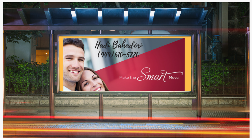
1 percent commission realtor in Los Angeles County