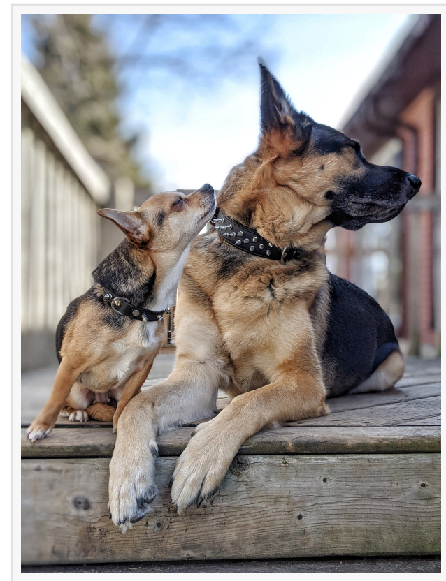
The Amsterdam collar is a timeless classic made with genuine leather and reinforced with stainless steel hardware.

Christmas arrived early this year at Angel Pet Supplies with stunning pet apparel and discounts to match.