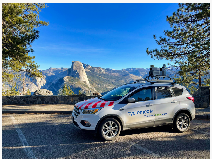
Cyclomedia data capture vehicle