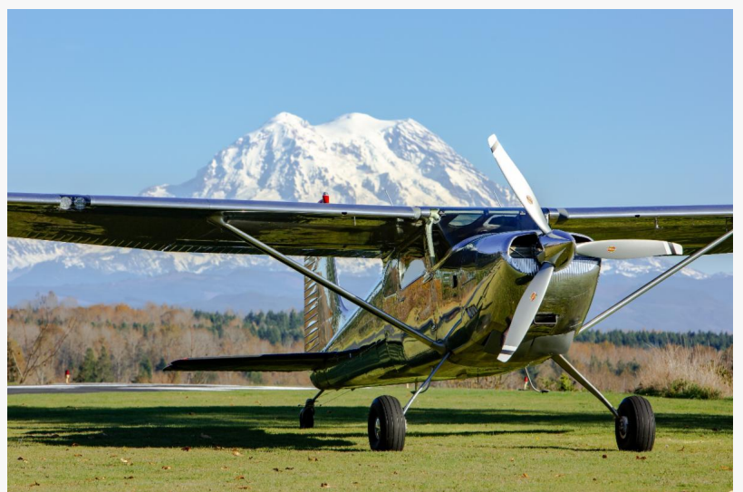
Hartzell Voyager Backcountry Propeller

PIQUA, OHIO, UNITED STATES, December 5, 2022 /EINPresswire.com/ -- Building on acceptance by backcountry flyers of Cessna Skywagons, Hartzell Propeller has once again expanded the applicability of its ubiquitous three-blade aluminum Voyager props. The Voyager, which is popular with bush pilots, was previously approved for other Cessna 180/182/185/206 aircraft powered by the Continental 520 and 550 engines.