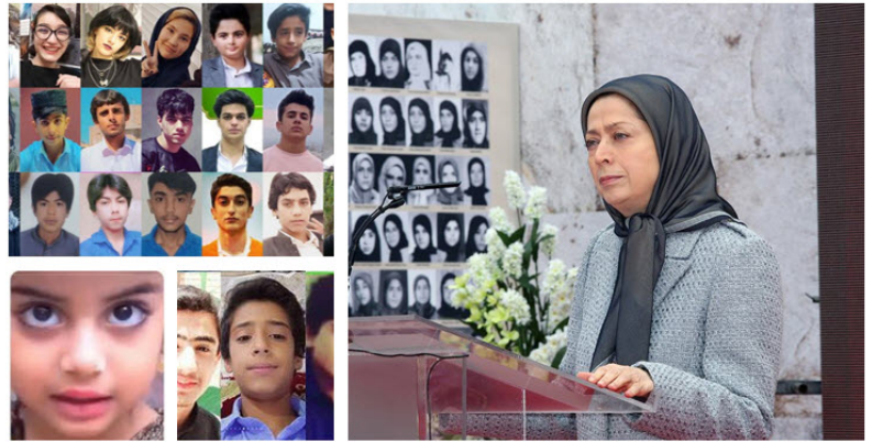
The Iranian opposition coalition (NCRI) President-elect Maryam Rajavi praised Iran's Baluchi community and said "Our Baluch compatriots rose again in step with the nationwide uprising to seek justice for those who laid down their lives for the freedom of Iran."