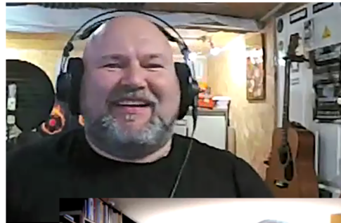
All The Things We Wanted To Be