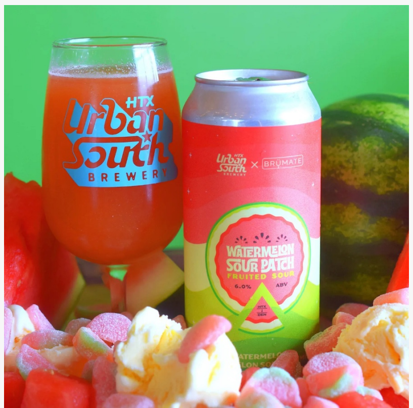
Urban South Brewery - HTX x BrüMate Watermelon Sour Patch Fruited Sour

HOUSTON, TX, UNITED STATES, December 5, 2022 /EINPresswire.com/ -- Urban South Brewery - HTX is excited to announce a second Spilled collaboration with innovative drinkware and cooler brand, BrüMate. Together, the companies created a limited edition Watermelon Sour Patch beer (6% ABV) with a hint of vanilla ice cream to make the perfect balance of sweet and sour flavors. In addition to the collaboration, Urban South - HTX is working with BrüMate on a limited edition custom Hopsulator Trio that will be available at the end of the year at both Houston and New Orleans taprooms.