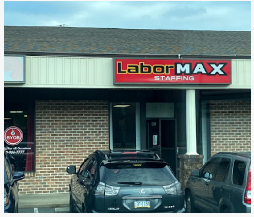
LaborMax Staffing - Allentown's Storefront

Finally, the fifth tip was delegating tasks efficiently. "It's easy for new managers to get bogged down in the details of warehouse operations, but it's crucial to stay focused on the big picture of the entire facility," Ramirez stated. "By getting to know the capabilities of your staff, investing