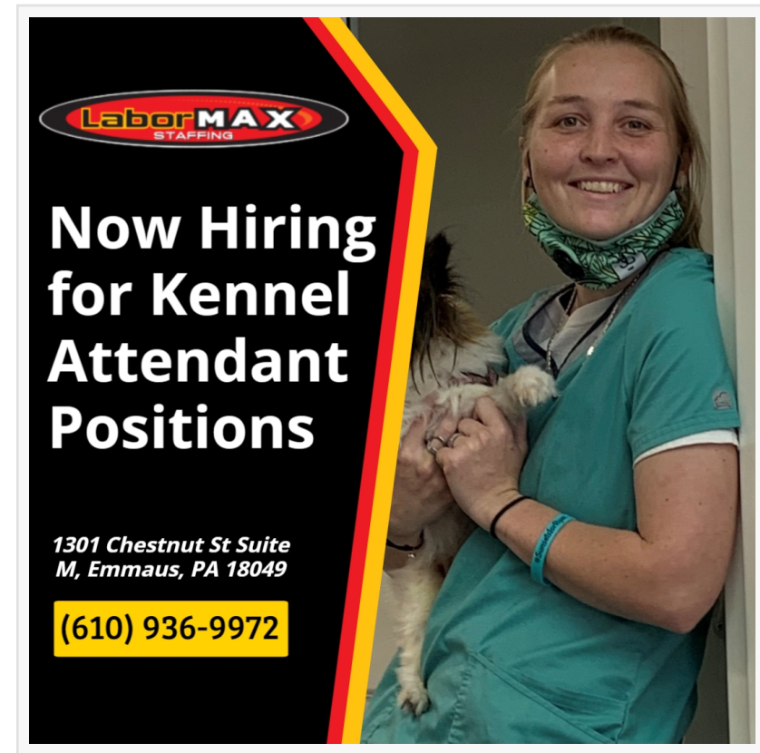
Hiring in Allentown

Avoiding micromanaging was the fourth tip mentioned. Although accuracy, safety, and efficiency are essential in every warehouse, no employee appreciates a manager constantly hovering over them to ensure they don't make a mistake. Throughout the white paper, it mentions to consider ways to help workers remain productive when unexpected events necessitate changes in the workflow without making them feel like they aren't doing their jobs.