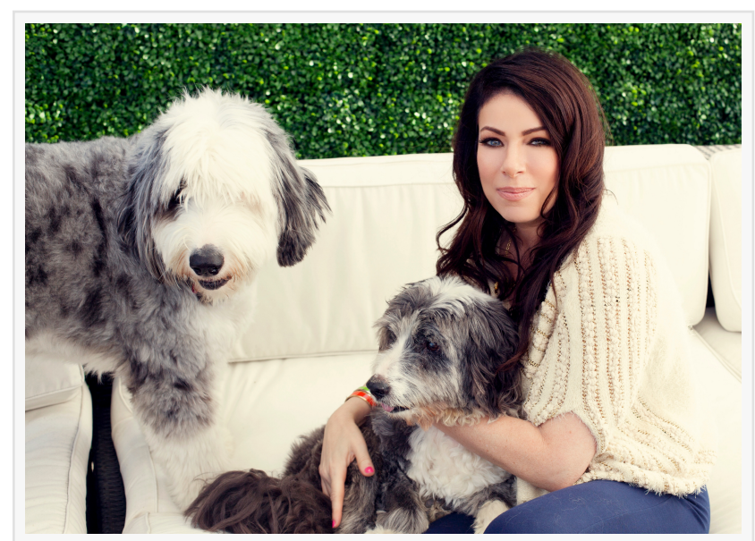
Sprays for Strays is a 501 (c) (3) Non Profit

This press release can be viewed online at: https://www.einpresswire.com/article/604757264