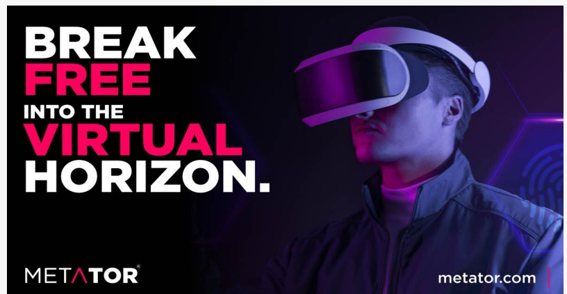
Metator - Possibilities Beyond Reality | Open Metaverse