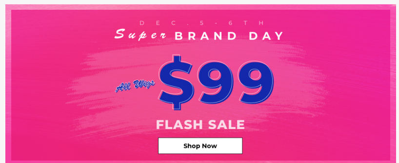
klaiyi brand day $99 flash sale wigs