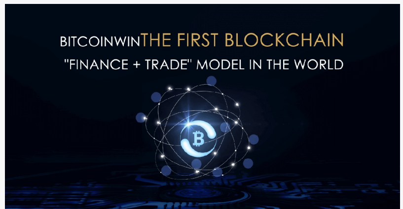
DBank Group BCWEX Blockchain

FinXeed combines new technologies such as big data, artificial intelligence, cloud computing, RBA robotics, as well as microservice operation and governance frameworks in