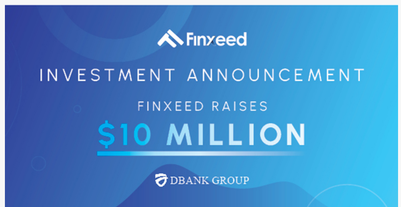
Investment Announcement FinXeed