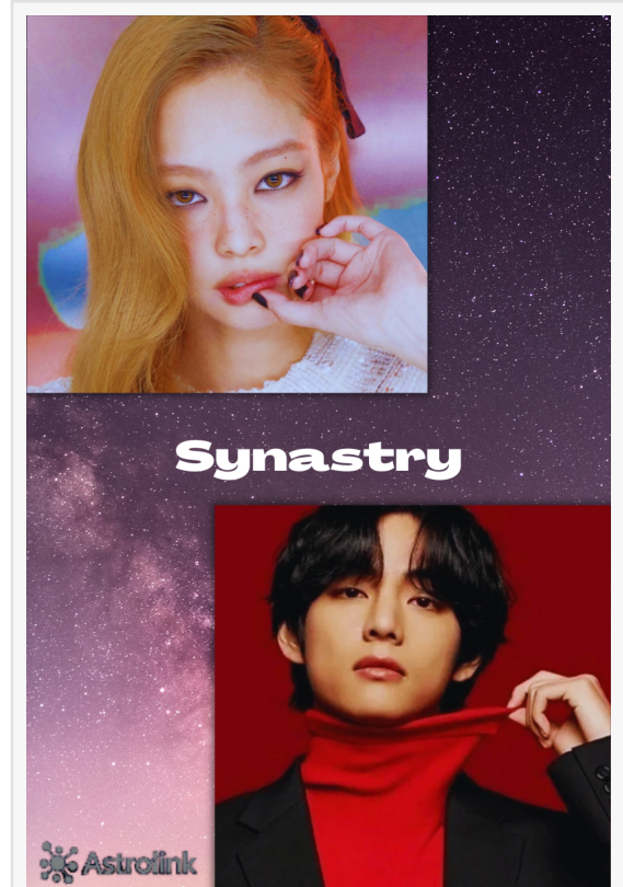
BTS Taehyung (V) and Blackpink Jennie

Both idols are in the Capricorn Sun sign, which means that they are both at their basis compatible with their energy, power, and essential values. While being the same Sun sign can be a great thing, since they are both very hard working it could lead to a stale relationship unless one or both of them attempt to keep the fire going. Moon placement has V with an Aries moon and Jennie with a Scorpio moon which at first glance would show some initial differences in emotion. While