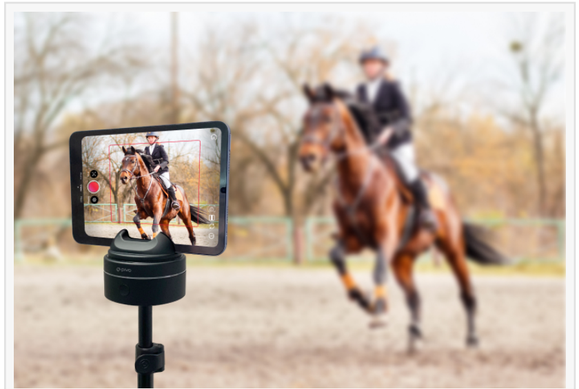
Pivo Max for Equestrians

This press release can be viewed online at: https://www.einpresswire.com/article/604859146