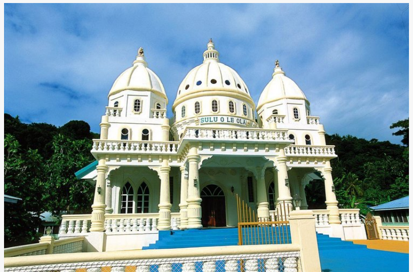
American Samoa, USA church