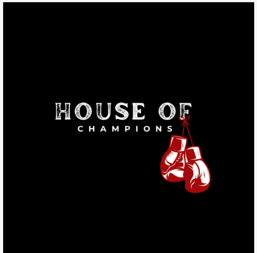
House of Champion logo