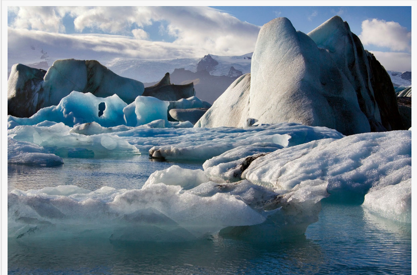
Black carbon coats glaciers and causes them to melt.

WASHINGTON, DISTRICT OF COLUMBIA, UNITED STATES, December 6, 2022 /EINPresswire.com/ -- Every member of the House of Representatives and the Senate will be receiving a copy of Burn Fuel Better: From Helpless to Hopeful in the Race Against Climate Change and a model resolution on eradicating black carbon.