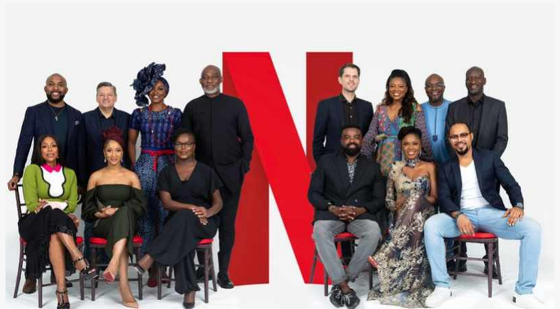
Netflix Productions Nigeria