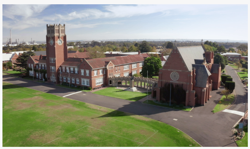
Geelong Grammar School, Victoria

This press release can be viewed online at: https://www.einpresswire.com/article/604983673