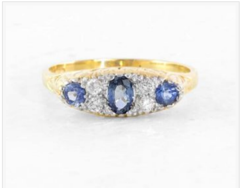
Oval Sapphire Diamond Multi Stone Ring GR063

Because proposal rings were used as a placeholder and were typically replaced with an