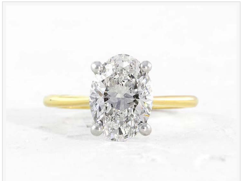
Oval Cut Diamond Solitaire Ring

Oval cut diamonds have remained a popular cut since the 1940s and help elongate the hand, making them an excellent compliment for most hand shapes.