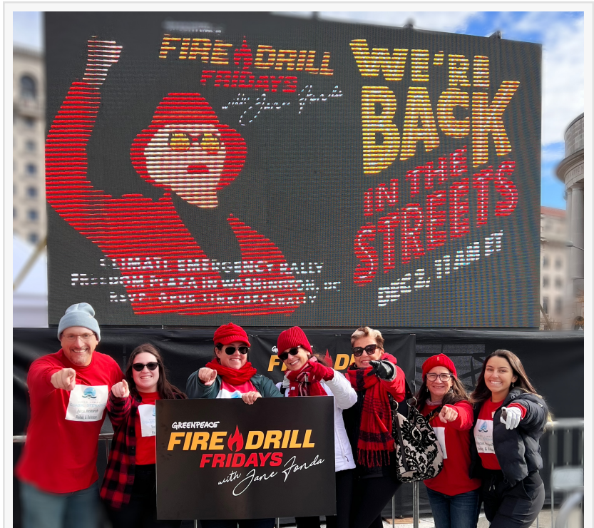
Pledge to REFUSE single use plastics

individuals are encouraged to REFUSE single-use plastics .