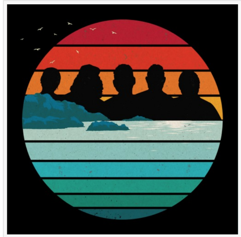
L.A.B's New Single, Take It Away