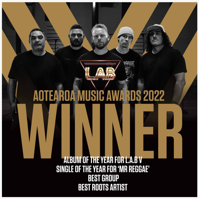
L.A.B win FOUR Aotearoa Music Awards for the second year running