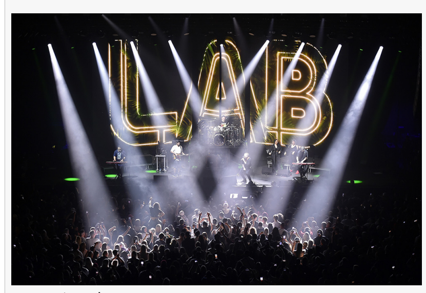
L.A.B Live Show

L.A.B win Best Record at NZ RollingStone Awards 2022