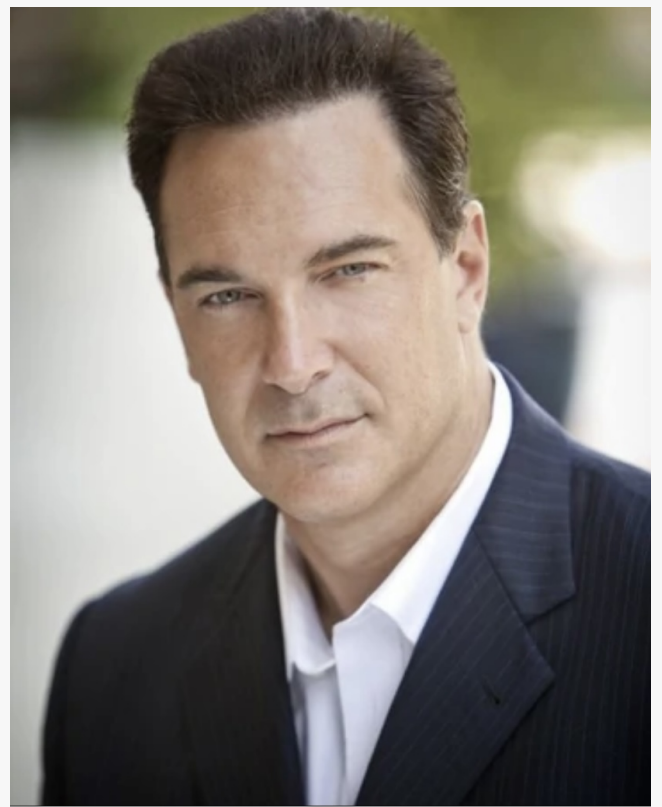
Actor Patrick Warburton Spokesperson for LuvSeats and St. Jude Children's Research Hospital

St. Jude Children's Research Hospital is leading the way the world understands, treats and defeats childhood cancer and other life-threatening diseases. Its purpose is clear: Finding cures. Saving children.® It is the only National Cancer Institute-designated Comprehensive Cancer Center devoted solely to children. When St. Jude opened in 1962, childhood cancer was considered incurable. Since then, St. Jude has helped push the overall survival rate from 20% to more than 80%, and it won't stop until no child dies from cancer. St. Jude shares the breakthroughs it makes to help doctors and researchers at local hospitals and cancer centers around the world improve the quality of treatment and care for even more children. Because of generous donors, families never receive a bill from St. Jude for treatment, travel, housing or food, so they can focus on helping their child live. Visit St. Jude Inspire to discover powerful St. Jude stories of hope, strength, love and kindness. Support the St. Jude mission by donating at stjude.org , liking St. Jude on Facebook, following St. Jude on Twitter, Instagram, LinkedIn and TikTok, and subscribing to its YouTube channel.