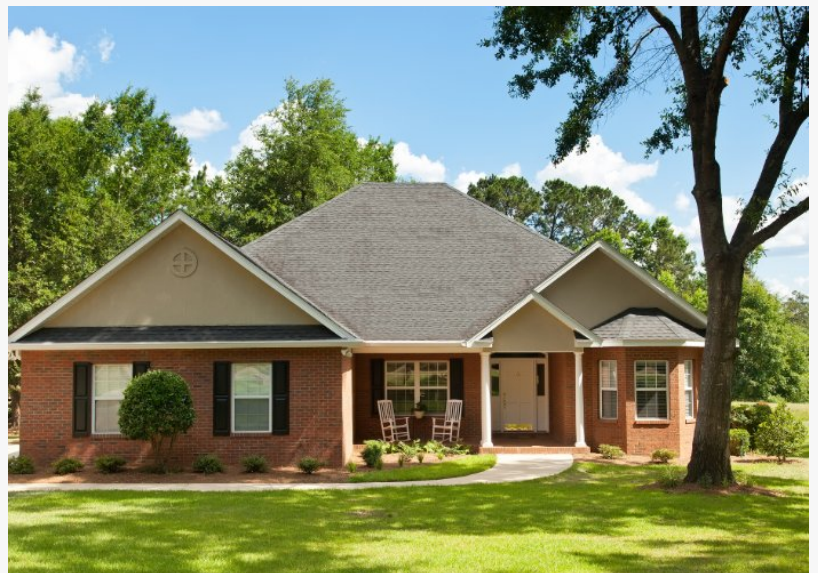
New roof after replacement in Rhode Island