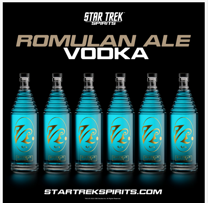
Romulan Ale Vodka