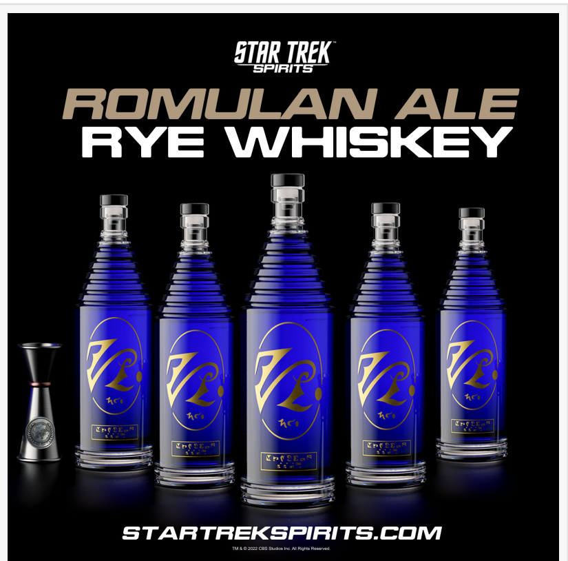
Romulan Ale Rye Whiskey

www.StarTrekSpirits.com and are now shipping to over 33 states, just in time for the holidays - order now while supplies last.