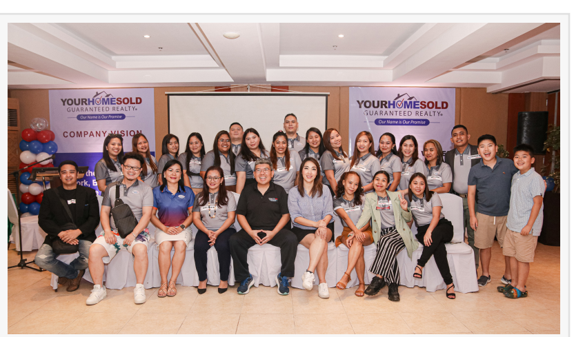
Your Home Sold Guaranteed Realty held event in Boracay Island to recognize the hard work its staff had been putting in the whole year.

Certificates of recognition were presented to top performers, including