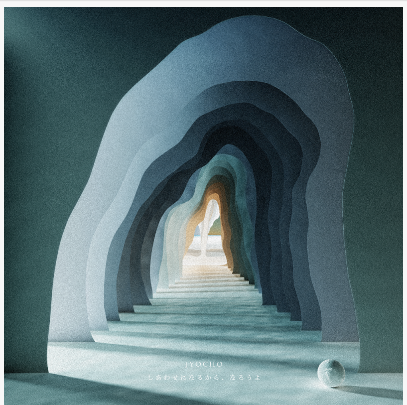
album cover art for Let's Promise to Be Happy