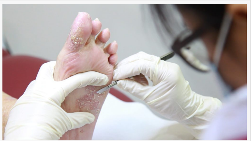
Global Wound Debridement Market Size