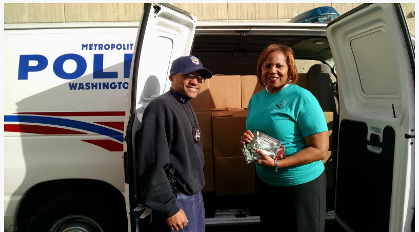
A Foundation for a Drug-Free World volunteer sharing booklets with a DC Metropolitan police officer.