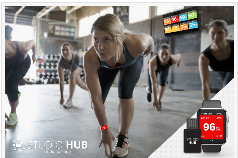
Studio Hub for group fitness classes

Media Contact Bred Ventures Inc +1 626-335-6520 inquiries@bredventures.com