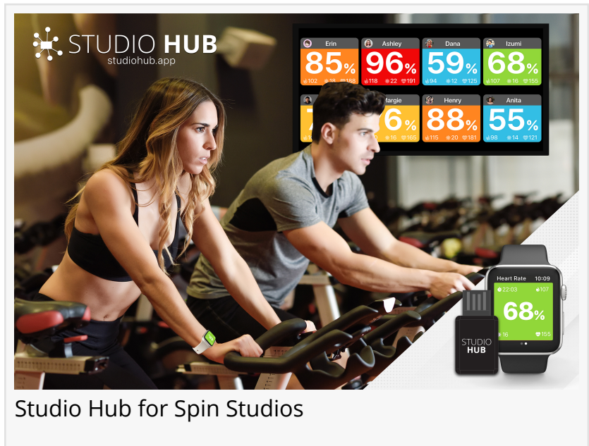
Studio Hub for Spin Studios

Gym and studio members can now enjoy a premium Apple Watch App experience while connecting heart rate to their favorite in-studio group fitness system. Members can use the built-in heart rate capability of their Apple Watch to connect directly to their group fitness systems eliminating the need for clunky and uncomfortable chest straps or armbands.