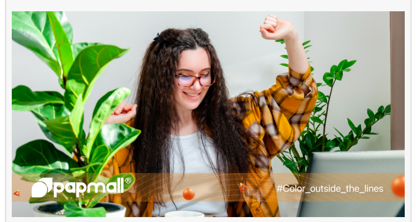
papmall® freelance digital marketing specialists can adapt to any urgent deadlines

of working hours, responsiveness, or long-time review process.