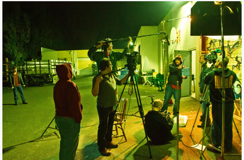
The crew at work outside Chrome Phoenix Studio