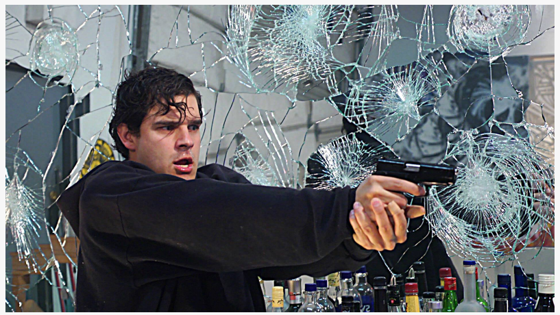
Detective Knight finds the tool he needs for the job