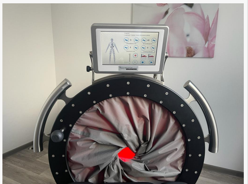
Non Invasive Body Contouring

For use in the special field of Body & Shape the REJUVENATOR PLATINUM ***** EXTERNAL HEART is also equipped with a beauty light near infrared light module - also known as photo-biostimulation - for an additional strengthening of the connective tissue as well as for tight, smooth and beautiful skin.