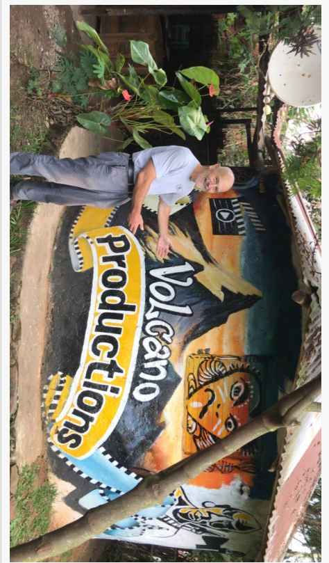
Volcanoes production studio

This press release can be viewed online at: https://www.einpresswire.com/article/605289510