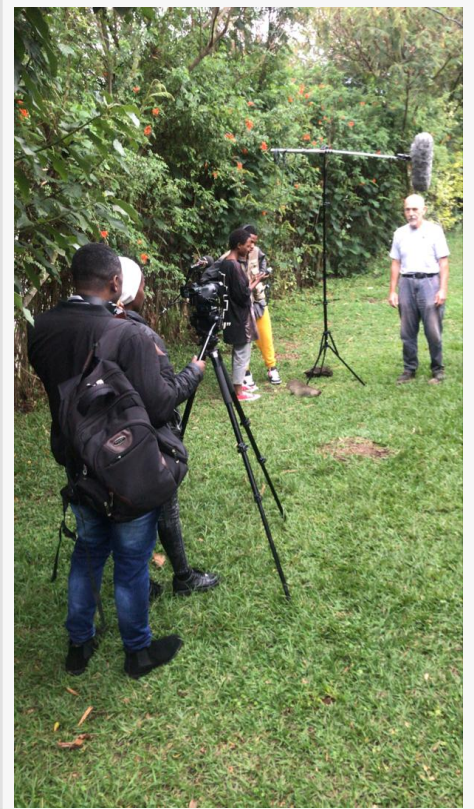
Learning how to make films