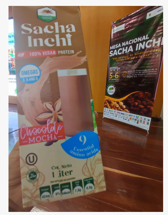
GMSacha Inchi presenting at the mesa nacional

"Starbucks Coffee Company and the Colombian Coffee Growers Federation (FNC) have announced an expansion of their program to support Colombian coffee growers in the Starbucks C.A.F.E. Practices network, that will see an extra 22 million trees planted in the country. In 2020, through an agreement, Starbucks provided the FNC with a USD $3 million investment to support a new coffee crop renovation program, with the goal of distributing 23 million coffee seedlings by 2023. Within the first year of the program, more than 7 million coffee seedlings were distributed to Colombian farmers.