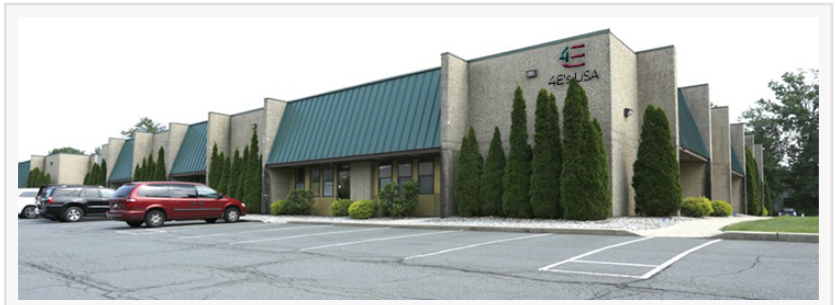
Four E's USA, A Four E's Scientific Company - US Headquarters

and an exceptional effort by our team as this occurred during our warehouse and assembly area expansion effort. We modeled our quality system on ISO 13485, which is a medical device manufacturing quality management system standard. This will support our future plans to manufacture and repair laboratory, medical equipment, and potentially fill/finish reagents. Our rigorous quality system helped us