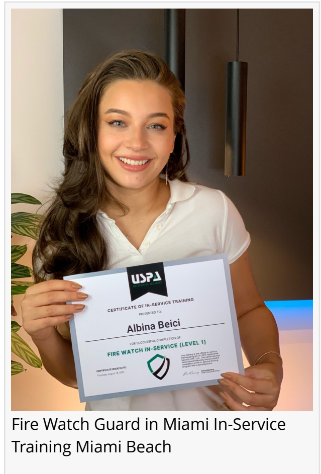
Fire Watch Guard in Miami In-Service Training Miami Beach

All USPA fire guards and clients have access to fire watch training. This month, the fire prevention division will also visit Broward and Palm Beach Counties.